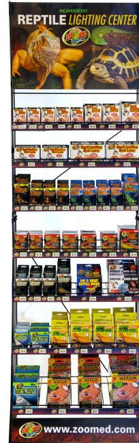
*Zoo Med® Incandescent Lighting Center