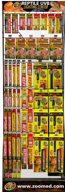
*Zoo Med® UVB Lighting Center