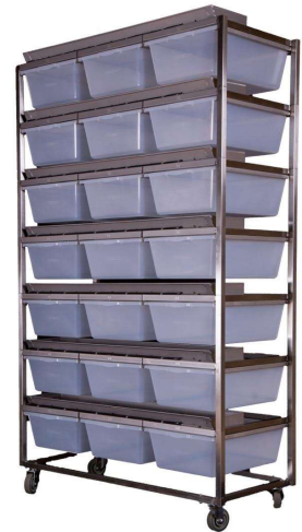
*Freedom Breeder® – Rodent 721