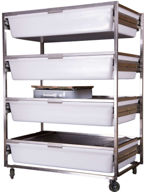
*Freedom Breeder® – Rodent 44