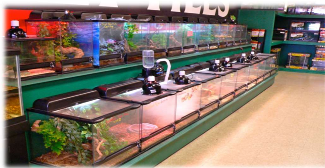
*Zoo Med® Naturalistic Terrarium Display