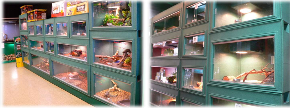
*Showcase Cages Display

(Scales 'N Tails® Ft. Collins pictured below)