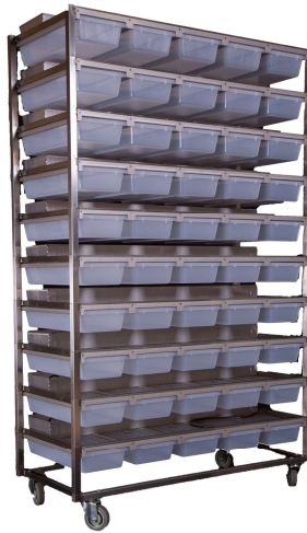
*Freedom Breeder® – Rodent 1050