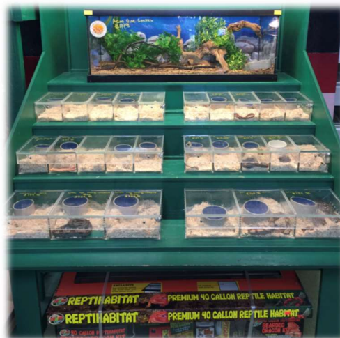
*ARS Caging Acrylic Baby Snake Display