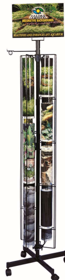
*Marina® Terrarium Background Display