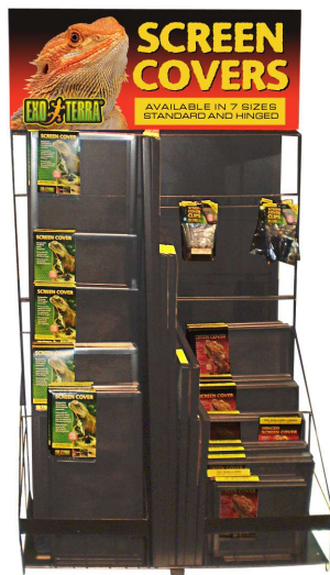
*Exo-Terra® Screen Cover Display